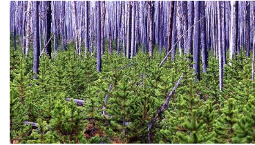
10 years after the 1988 Yellowstone fires, Lodgepole pine forests reestablish themselves amongst still standing dead trees.

The lodgepole pine makes up 77 percent of Yellowstone’s forests and actually has its own fire insurance. The pine produces two kinds of seed bearing cones. One cone releases its seeds normally. But the other cone is coated with a strong resin that keeps the cone sealed shut. These cones may remain sealed shut on the tree for decades until a fire burns off the resin and causes the core to release its seeds. After a fire, there are up to 20 seeds for every square foot of forest lying on the ground, ready to sprout in the newly enriched